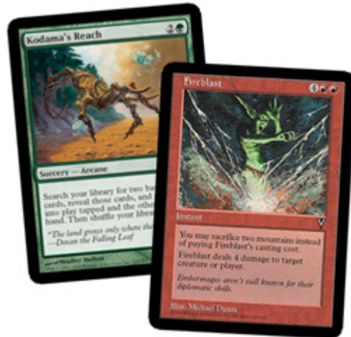
Before this, there was . . . this.

For example, I lost a match just this past weekend because I destroyed my opponent with triple Cabal Therapy and triple Duress in the first two turns of games two and three. It seemed nice to put my very good opponent on no spells so early, but I didn't have any pressure and he just topped an Intuition to dig himself out of the discard and recover in the midgame . . . I could have held that valuable disruption to execute on a more meaningful turn six or eight, but instead ate a Mana Short and Corpse Dance respectively.